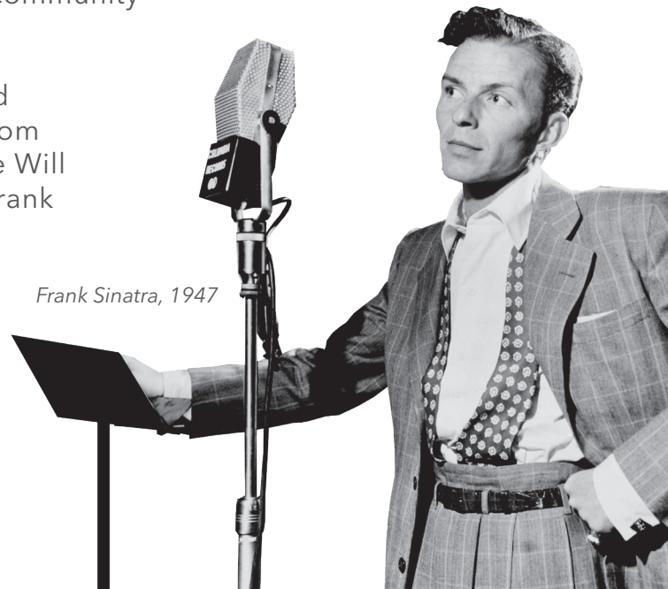
Frank Sinatra, 1947