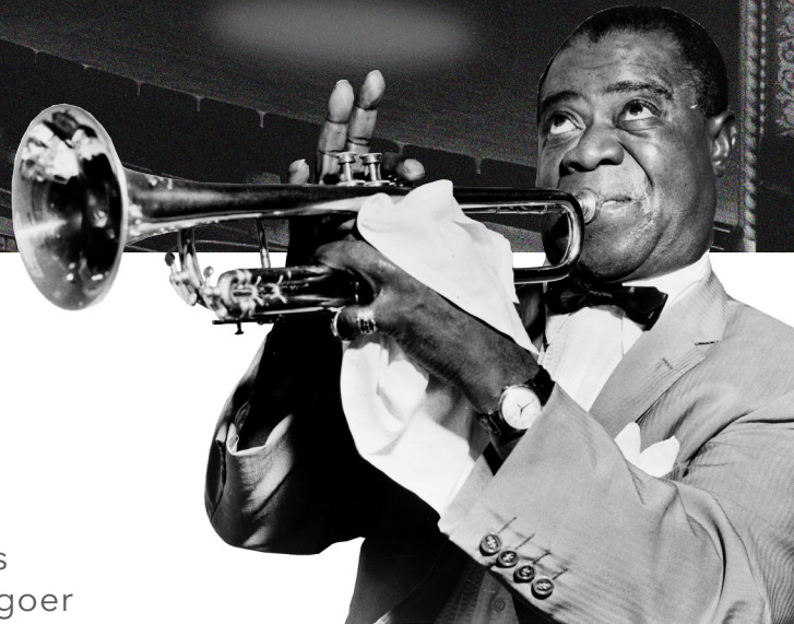
Louis Armstrong, 1953

Today, if you're here between shows, you can hear the echoes of local children and adults who filled this happy place time-after-time for symphonies, plays and world premieres like Knute Rockne All-American. The buzz was electric.